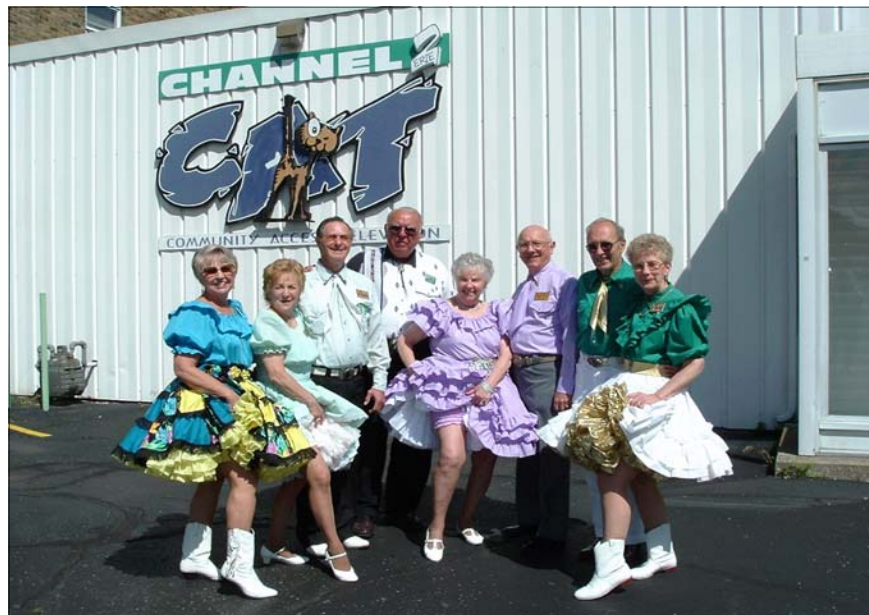
Members of the Erie Area Square and Round Dancers Association strike a pose after their stellar performance on “Amazing Grays” on June 23, for The Card Table Connection.

This is what your support enables. You empower these community members to produce programming that is entertaining, inspiring, informational, diverse, and, most importantly, local . Thank you, from all of us at Community Access Television.