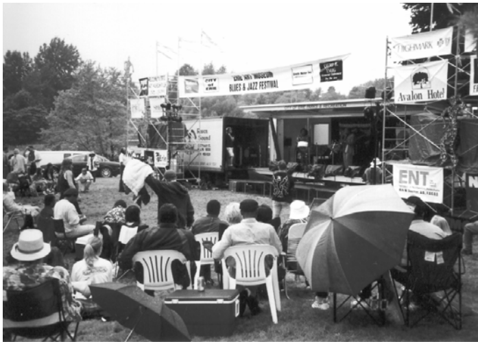
Erie Art Museum Blues & Jazz Festival Frontier Park